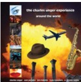
Around the World