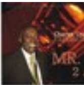
Mr 2 AM